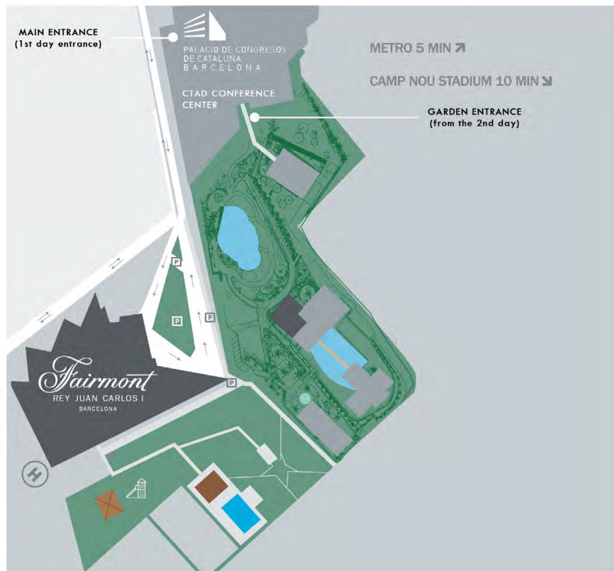
Map of the conference hotel and congress center

Fairmont Rey Juan Carlos I & Palacio de Congresos de Cataluña Av. Diagonal 661 - 671 Barcelona Spain 08028